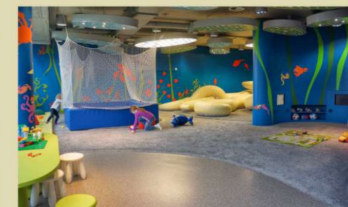
Children Play Zone