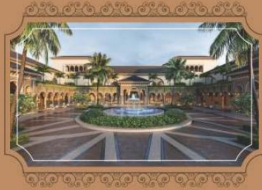
KARINGTON CLUB & RESORT